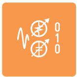
Sensor / MEMS