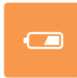
Power / Battery